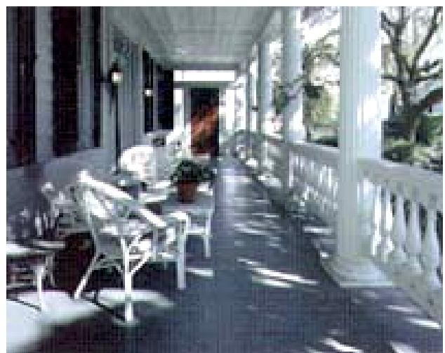
Thomas Lamboll House Charleston, SC