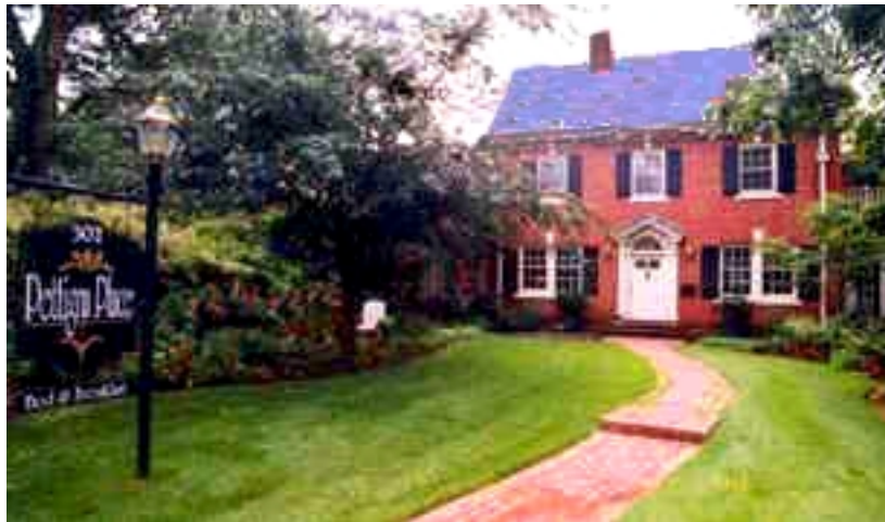
Pettigru Place Bed & Breakfast Greenville, SC

South Carolina Bed & Breakfast Association: http://www.usagetaways.com/sc/scbba/index.html