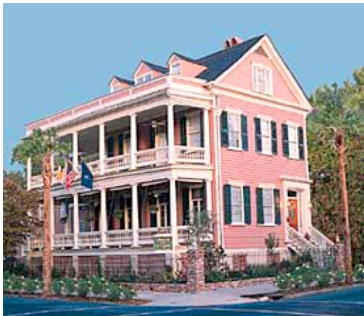
The Ashley Inn Bed & Breakfast Charleston, SC

Target travel agencies in nearby large cities for a sales blitz. (Charlotte and Atlanta, for example) Get a phone book from the targeted cities or contact their state tourism offices and request a listing of the travel agencies in their state. Consider a direct mail piece to all agencies offering them a free night stay per travel agency. This will give you an opportunity to have them familiar with your property and better sell the area as a destination. Send travel agents information on the area as well as a cover letter. Consider offering a travel agent's discount to any other agents from their agency who wish to come. They may not recommend your property if they are not familiar with it. (This could be done in the form of a postcard with a picture of your property on the front, if you want to watch costs.)