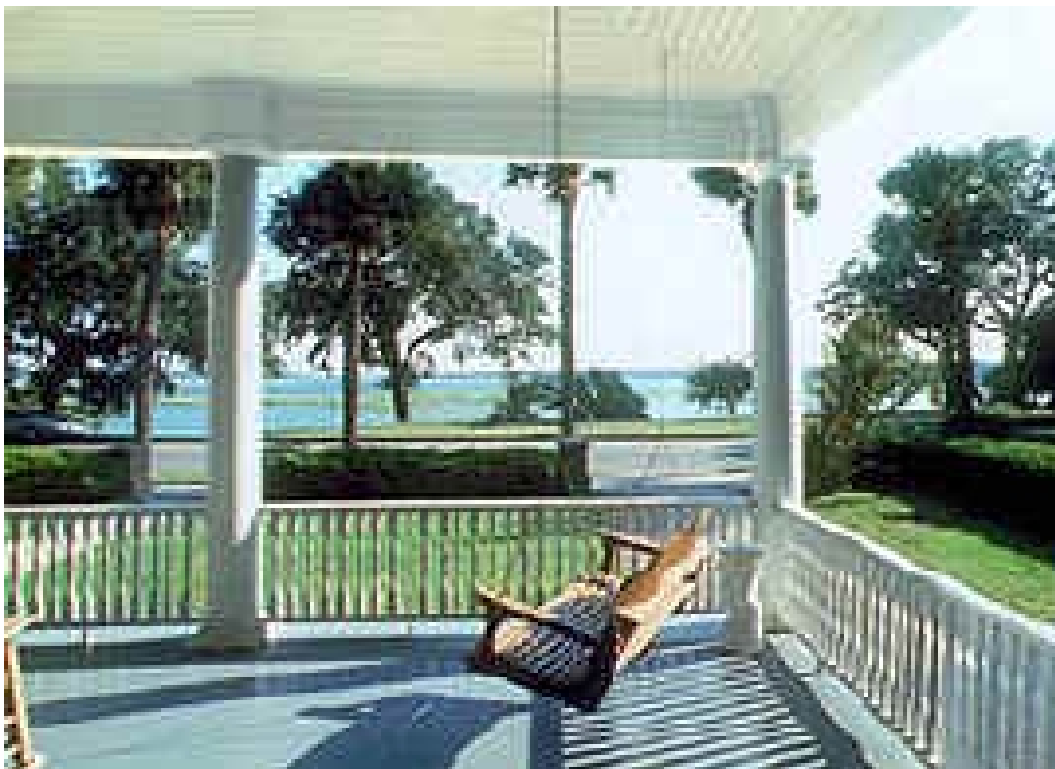
Two Suns Inn Bed & Breakfast, Beaufort, SC http://bnblist.com/sc/twosuns/

Fire Safety is another item that requires the understanding of state and local codes. In many areas the building codes cover fire safety. Your B&B should have smoke alarms, marked exits, and visible fire extinguishers . Local regulations may also require fire doors, additional exits, and storage areas for flammable materials. Be sure to thoroughly review your requirements with the local officials.