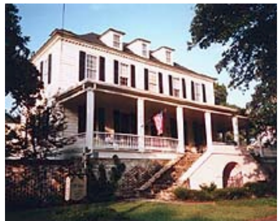
1790 House Bed and Breakfast

Rural Development Coordinator Division of Community Development SC Department of Parks, Recreation & Tourism 1205 Pendleton Street Columbia, SC 29201 Telephone: 803/ 734-1449