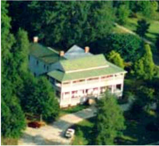
Liberty Hall Inn Bed & Breakfast Pendleton, SC