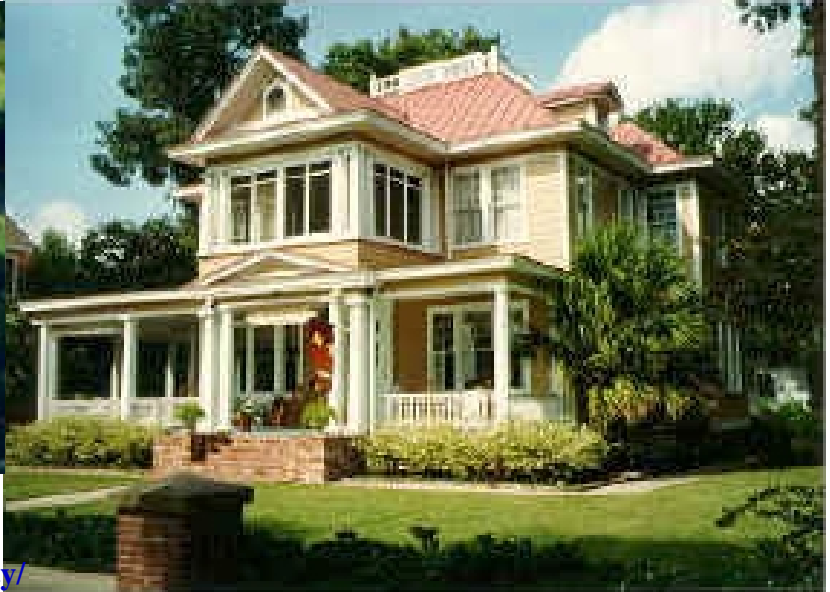
Two Suns Inn Bed & Breakfast, Beaufort, SC