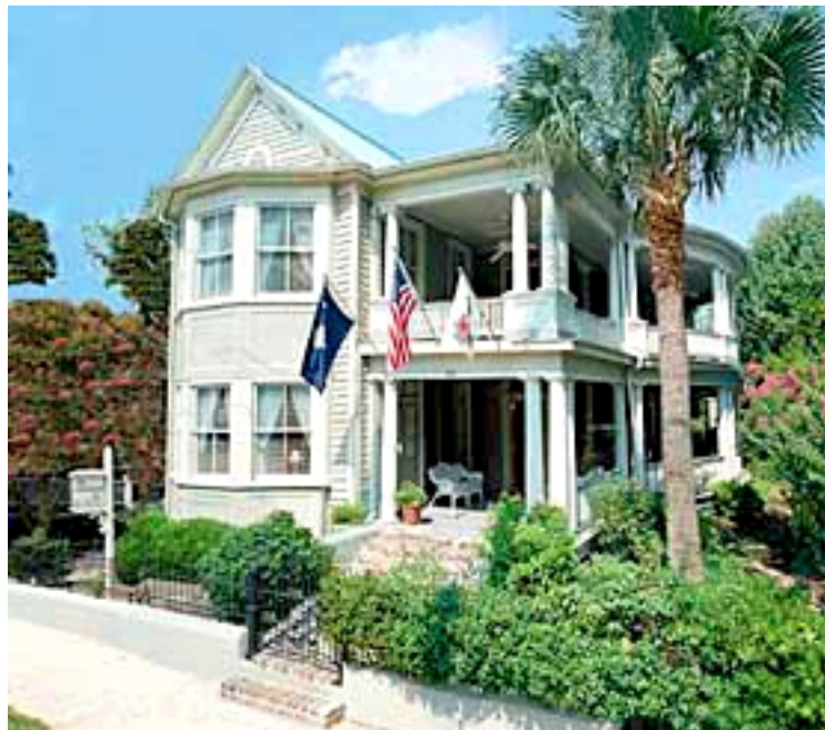
The Cannonboro, Charleston, SC

Contact the South Carolina Division of Tourism's Group Tour Marketing Division (803/ 734-0128) and ask to receive their contact lists from the National Tour Association, American Bus Association and Travel South Market Places. These are lists of tour operators that they have met with who have expressed an interest in bringing group tours into the state. These tour operators should receive the information described above from you as well.