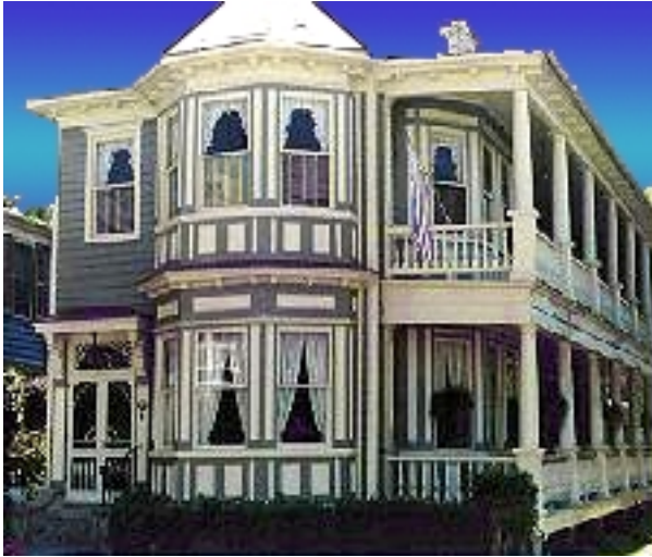
Country Victoria Bed & Breakfast, Charleston, SC http://www.virtualcities.com/ons/sc/z/scz3701.htm