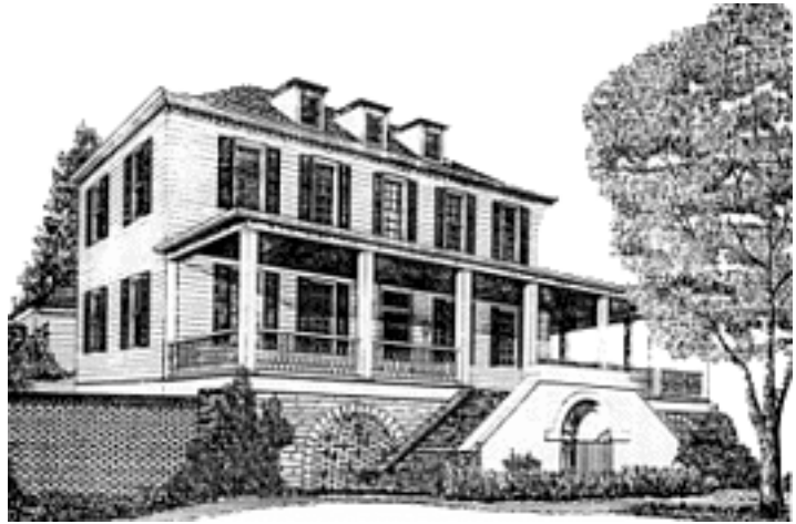
1790 House Bed and Breakfast, Georgetown, SC http://www.1790house.com/index.htm