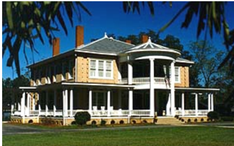
Abingdon Manor, Latta SC

http://bnblist.com/sc/abingdon/abingdon.html