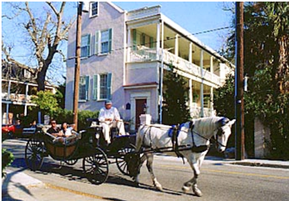
Fantasia Bed & Breakfast, Charleston, SC http://bnblist.com/sc/fantasia/fantasia.html

BEFORE SENDING ANY LITERATURE TO THE CENTERS A SAMPLE MUST BE SENT TO THE CENTRAL OFFICE FOR APPROVAL AND FOR MAILING INSTRUCTIONS. PLEASE CONTACT THE MANAGER OF VISITOR SERVICES, PRT, 1205 PENDLETON STREET, COLUMBIA, SC 29201 BEFORE TAKING ANY ACTION. (803/734-0125)