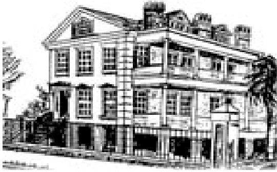
Beauguard House, Charleston SC http://www.charlestonbedbreakfast.com/